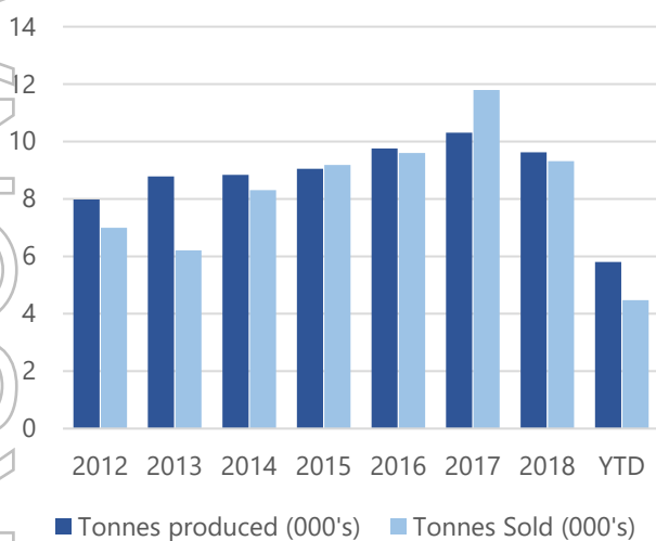
Figure 2- Skaland Production and Sales

*Year to Date – 1 st January – 30 th September 2019